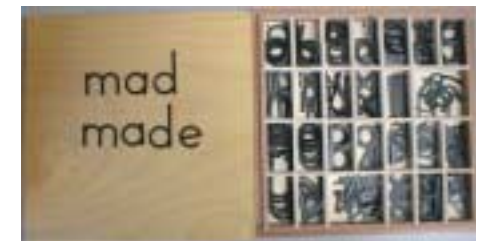
The small moveable alphabet. See Primary.