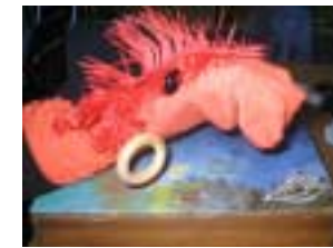
"Miss Odd" from the phonics box: how to learn short vowels.