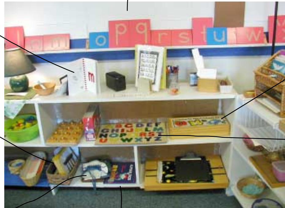
Sandpaper letters: children trace the shape of a letter with their index finger. Sensory, kinesthetic experience; muscle memory