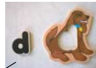
Alphabet puzzle, lower case: picture to letter association, initial letter sound