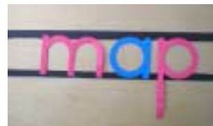
Moveable alphabet: learn letter names and sounds, blending sounds, building words and sentences without the frustration of writing. See Lower El.