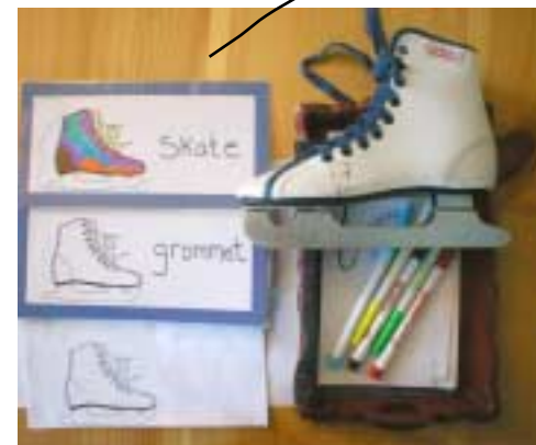
Alphabet picture book: visuals of alphabet, vocabulary, letter shapes